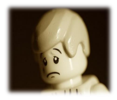
© 2018 OUHSC CCAN Neglect Child Trauma Services Program