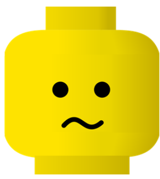
Substance Abuse by Family Member <sup>4</sup>